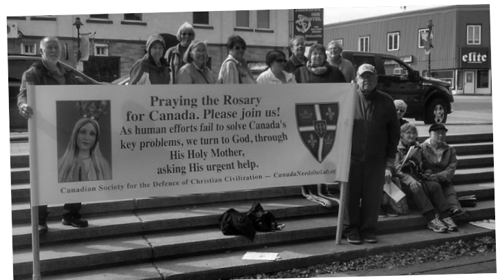
LITTLE CURRENT, ONTARIO

*Tens of thousands of Catholics will attend these rallies and pray for the conversion of Canada in a public place in honour of the Marian apparitions at Fatima, Portugal. Hundreds of thousands will see them and be invited to conversion.