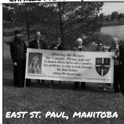
EAST ST. PAUL, MANITOBA