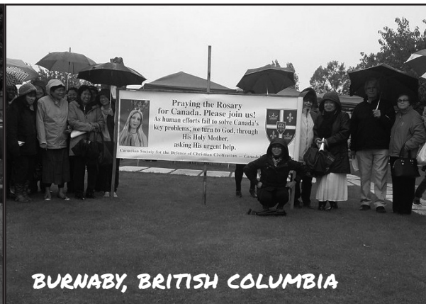
BURNABY, BRITISH COLUMBIA