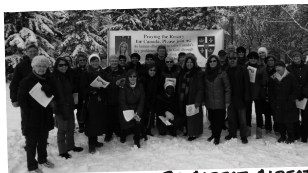
ST. ALBERT, ALBERTA

"Despite the wind and rain I felt a warm feeling surround me."