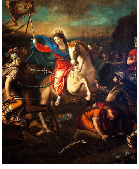
A painting of Madonna delle Milizie, Bartolomeo Pascucci

white stallion with a drawn sword and charged against the Turks in a terrible blue cloud of smoke. The Turks were driven back and suffered a crushing defeat.