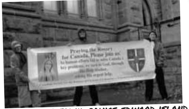
CHARLOTTETOWN, PRINCE EDWARD ISLAND