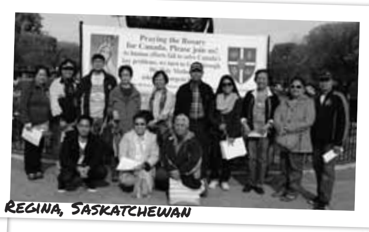
Thanks for the manual, the picture of Our Lady and the beautiful banner which all helped to extend an invitation to our parishioners and made the rally more meaningful.