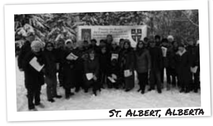
"Our rally location was on a busy street, with lots of pedestrian traffic and streetcars passing by. There were no negative reactions and quite a few encouraging expressions! Promotion of the Holy Rosary must be publicized to ward off perdition and welcome peace towards the triumph of the Immaculate Heart of Mary! DEO GRATIAS!!"