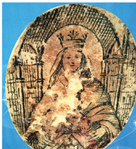
Photograph taken at the Holy Relic of Our Lady of Coromoto in the Basilica of Our Lady of Coromoto

The statue is so small that one needs a magnifying glass to see what is engraved on an oval object of minute proportions. It measures only 7/8 in. x 1 in. Although the statue is small, it nonetheless represents an immense mercy. Our Lady of Coromoto, as represented in this statue, is the patroness of Venezuela and her story is unique. In 1652, the Most Holy Virgin appeared to the chief of the Coromoto Indians, whose lands were near the modern city of Guanare. She told him to go to the region where the white men were and that they would throw water on their heads so they could go to Heaven. This was a clear allusion to baptism, but baptism requires certain moral dispositions that include a change of life to fulfill the commandments of the Law of God. This was a problem because Chief Coromoto, after a short period of fervour, did not want to abandon the vices that lamentably are common to many tribes of the region. Accustomed to a nomadic life, with no rules other than that of the strongest, it was obvious to him that Catholic moral law was onerous. So, at a certain moment, he decided to flee and return to the jungle to recover the “liberty” he had had before being baptised. Worse, he took the members of his tribe with him.